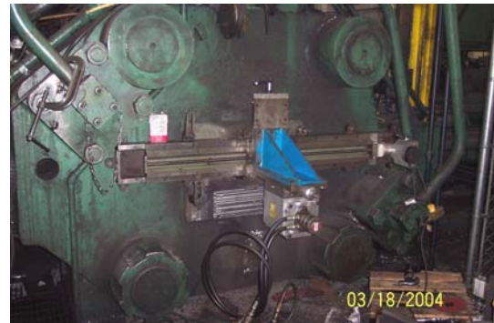
On-site milling of Extrusion press