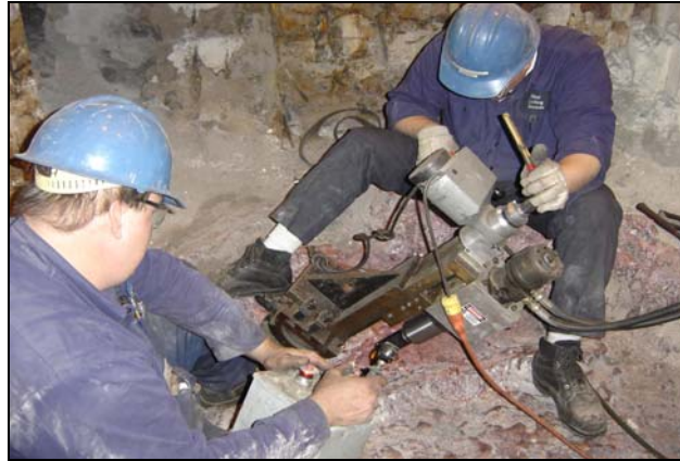
Two-man crew boring holes inside a smelting pot

No Job too Hot or too Cold... What happens when your melting furnace drops a heating coil and you freeze a 60,000 lb. slug of zinc? You call Metal Locking Service, just as Luvata Buffalo (formerly Outokumpu American Brass) did. We bored two 3" diameter holes 40" deep (see picture to right) and attached a lifting fixture. We then lifted the slug out of the smelting pot with no damage to the pot or remaining coils. All work was done on-site and within budget.