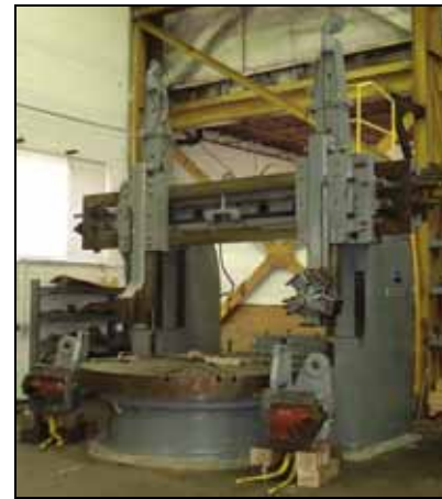
Vertical Boring Mill

In the Shop , we have increased our turning capacity through the addition of a large Betts Vertical Boring Mill. This unit can swing 124" in diameter. All new electrics and controls are being installed, along with 2 axis digital readouts.