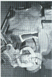
Before - Crown from Single Crank Toggle Draw Press - bearing boss broken away.