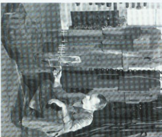
Back in alignment and permanently repaired with Metalock cold process of repair.