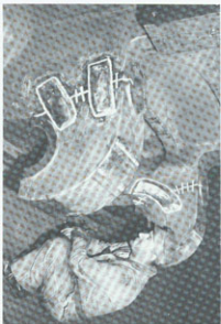
After - Crown now with both bosses repaired - alignment regained.

We offer you PERMANENT casting repairs with lasting dependability.