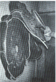
Blower Casting from Calajitlic Cracker, damaged by explosion, causing complete shut-down of plant. Returned in 96 hours after repair by Metal Locking process.